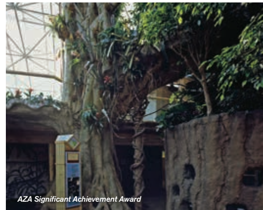
AZA Significant Achievement Award