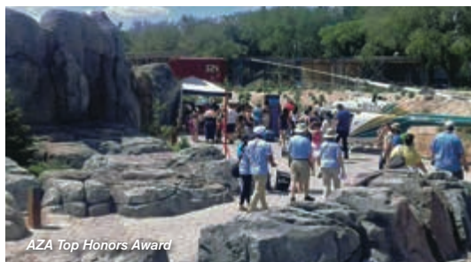
AZA Top Honors Award