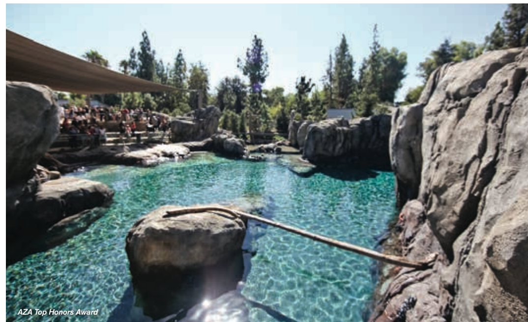
AZA Top Honors Award