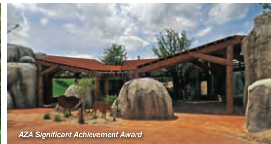
AZA Significant Achievement Award