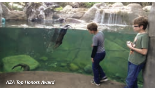
AZA Top Honors Award