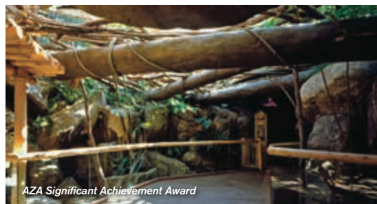
AZA Significant Achievement Award