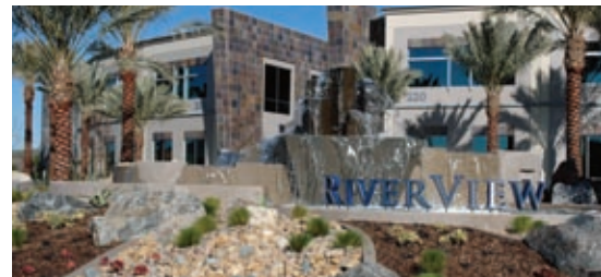
• Water features