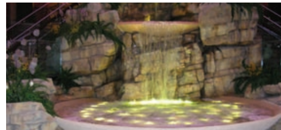
• Water features