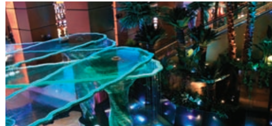
• Water features