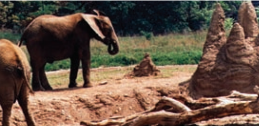
• Rock work