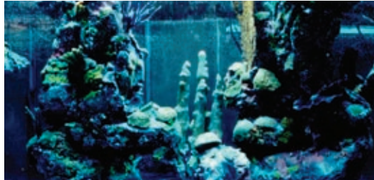
• Theme facades