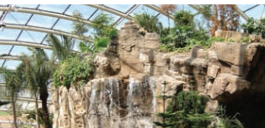
• Rock work

Simulated coral created by COST is widely used in aquariums worldwide. An extensive library of Atlantic, Pacific, Indian Ocean and Red Sea Coral molds allows us to create nearly any type of underwater environment. COST also installs acrylic windows and life-support systems, offering a complete scope of services for aquarium projects both large and small.