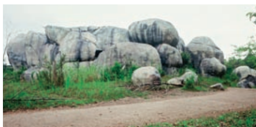
• Theme facades