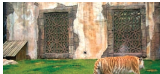
• Rock work