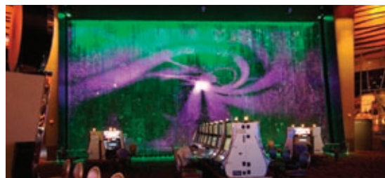
• Rock features